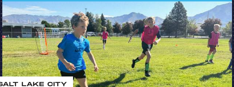
SALT LAKE CITY